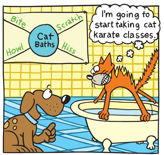
"My information wheel summarizes how cats act when they get baths."